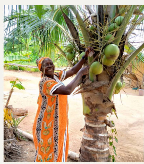
Adom Cocoa farmers cultivate coconut trees for additional income.

Through continuous training of members on climate-smart agricultural practices, about 30% of new farms established by members are adopting modern farm practices while old farms are adopting sustainable land management practices.