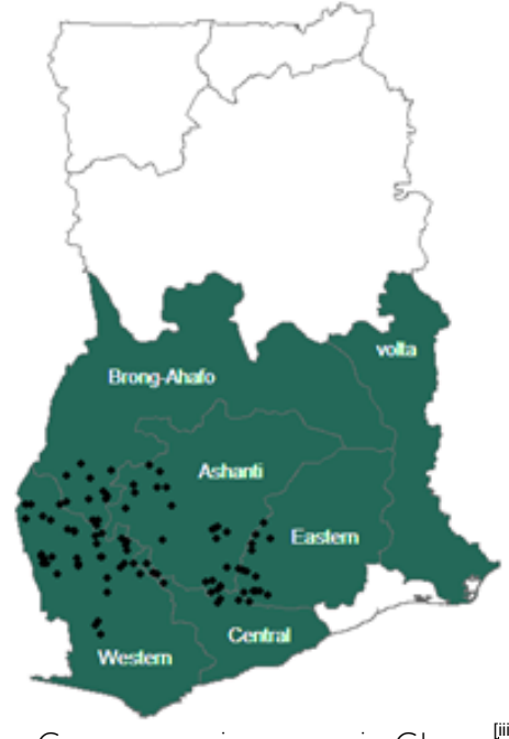
Cocoa growing areas in Ghana.[iii]

All LBCs deliver cocoa to the Cocoa Marketing Board (CMB), a subsidiary of COCOBOD, for further delivery to domestic and international buyers. Where local or international buyers have a direct purchase contract with an LBC, the CMB acts as a middleman to receive and forward the cocoa beans to the COCOBOD also secures and distributes funding to LBCs for their operations, usually at 16-18% interest per annum and lower than average market rates of around 35%.