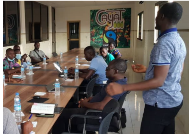
Cayat farmers are trained on agroforestry, which involves planting fruit and timber trees alongside the cocoa trees.

Beyond this, Cayat has invested in green energy, water infrastructure, and building schools and health centers. Between 2015 and 2021, three schools were Kong, Yakasse Attobrou, and Diangobo. New health centers were also built in Yakasse Attoubrou and Becedi Brignan.